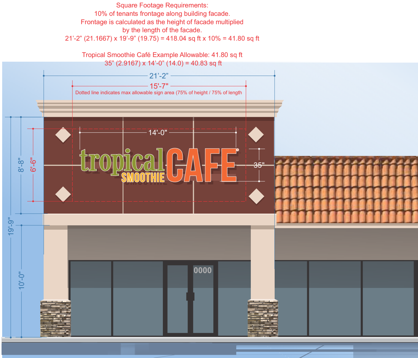
Tower Style B Elevation / Partial Building 2